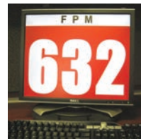
View machine status on the factory floor, desktop PC, or your smart phone.