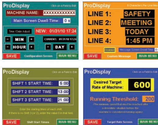
Remote view configuration screens

The ProDisplay™ system arrives pre-programmed to your specifications. Remote view configuration screens allow the user to view current running statistics, easily modify Target Rates and Goals, and create a custom “Message of the Day” display directly from your desktop. No software to install, maintain or support.